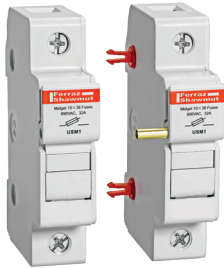
UltraSafe fuse holder with USPTH Pin-Ties