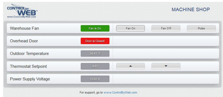
Example X-418 Control Page